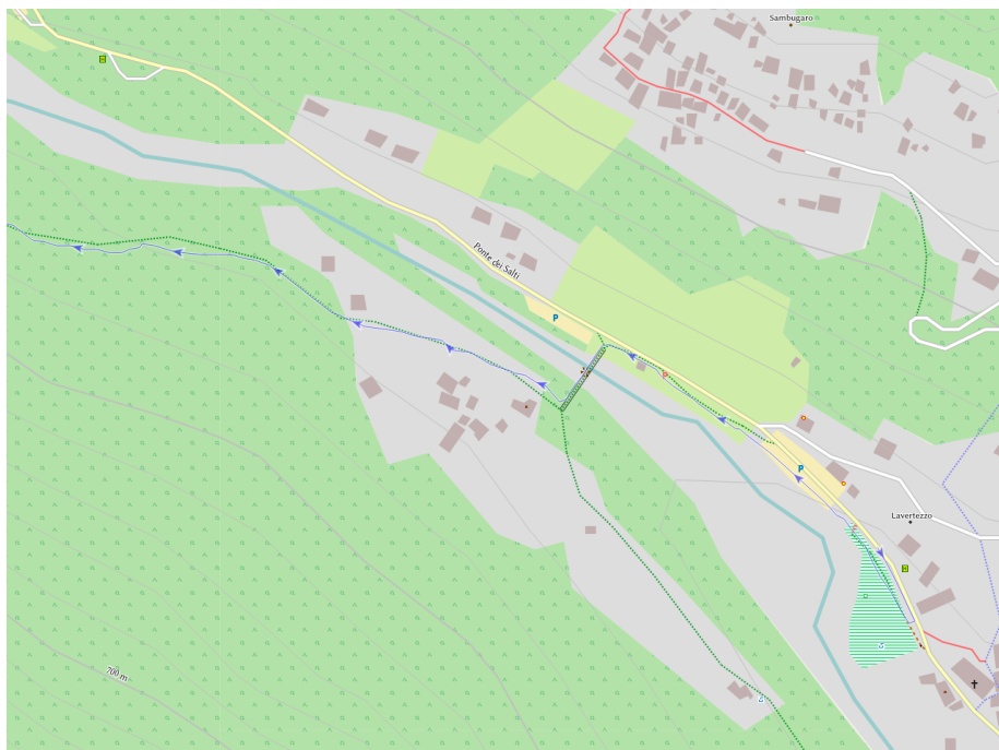
Figure 4: Crossing over the double arched Bridge