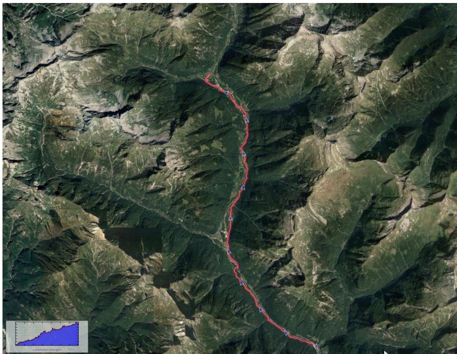
Figure 3: Satalite