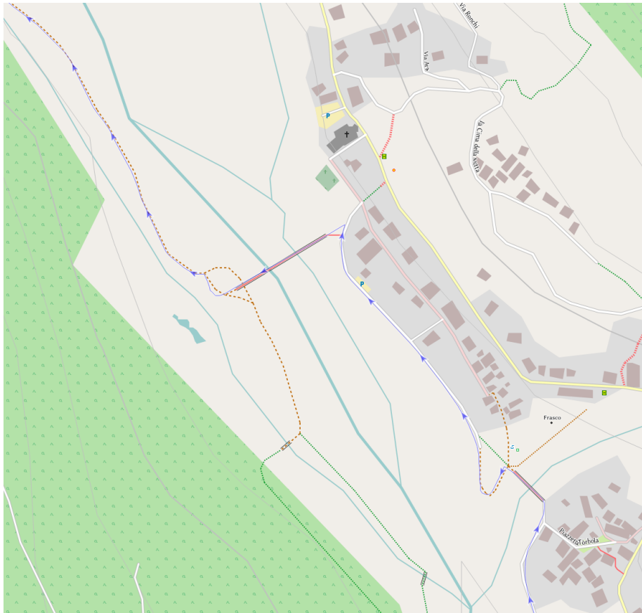
Figure 6: Crossing over the bridge in Frasco